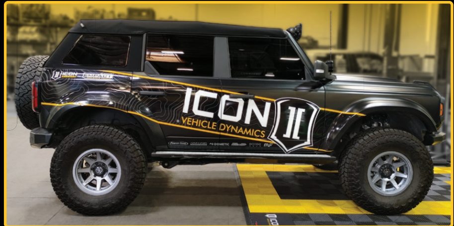
IMAGE SHOWN WITH OVERLAND SPRING INSTALLED WITH NO ADDITIONAL WEIGHT